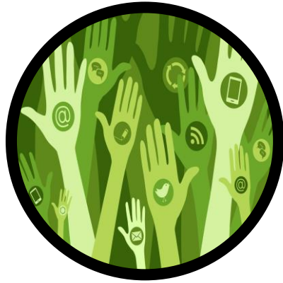
To Meet and Communicate