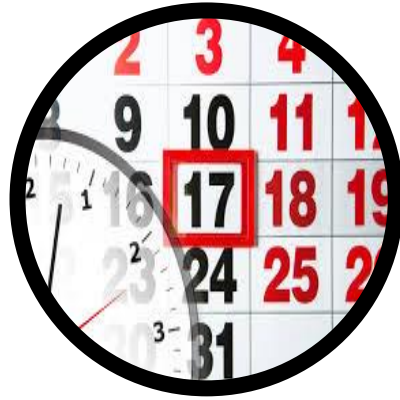
To Plan & Organise