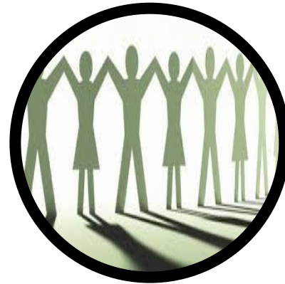
To live healthy