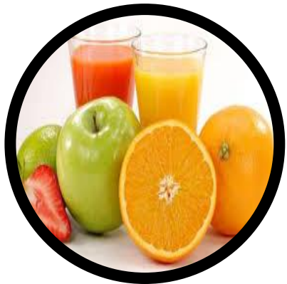
To Eat and Drink