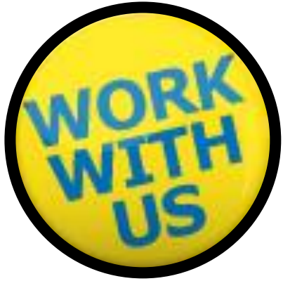
To Enable Work