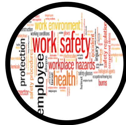
To be safe and secure