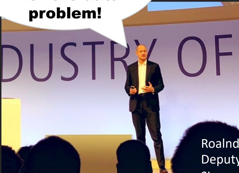
Roalnd Deputy CEO, CTO Siemens AG 2019

It all starts and ends with the data problem!